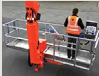
Roomy working cage