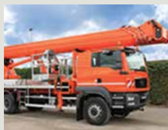
Multi-Chassis STEIGER® Brands