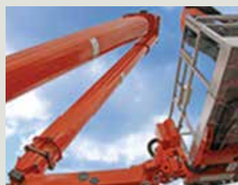
Multi-bevelled boom technology