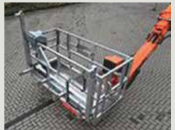
MULTIFUNCTIONAL work cage