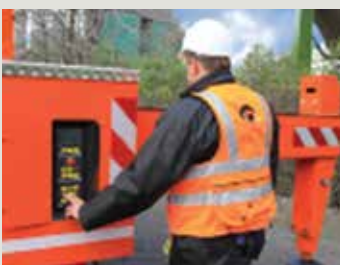
Multifunctional support control